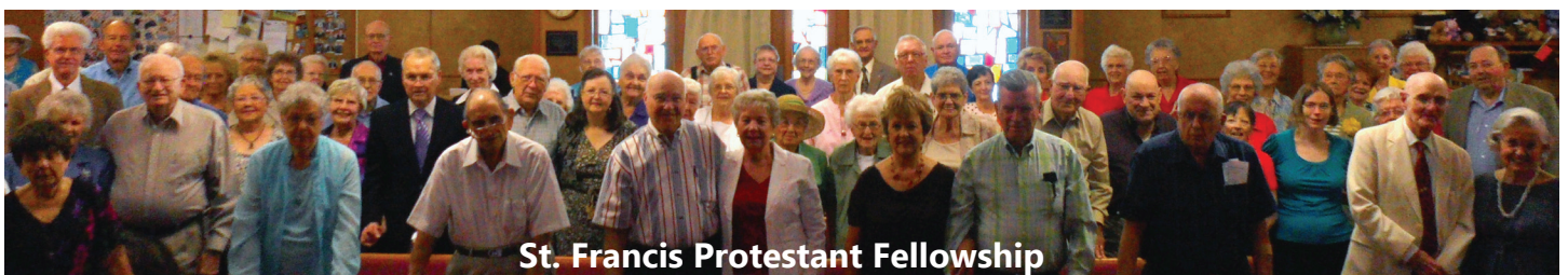
St. Francis Protestant Fellowship

The people at SFPF were very warm and made me feel right at home. It was a joy to be there.